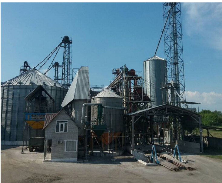
Nemyriv Grain Elevator