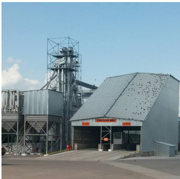
Vinnytsia Grain Elevator